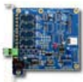
GV-NET Card V3.1