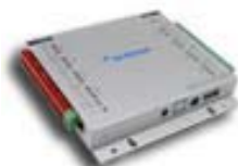
GV-IO Box 4/8/16 ports